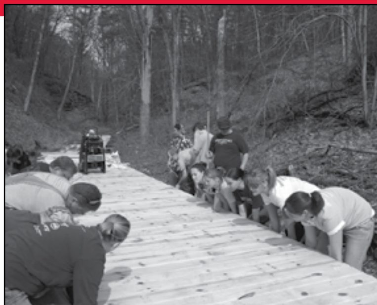
Volunteers from a number of businesses and community groups worked together to build a boardwalk that will be shared by campers from Camp Wawbeek and Respite Camp.