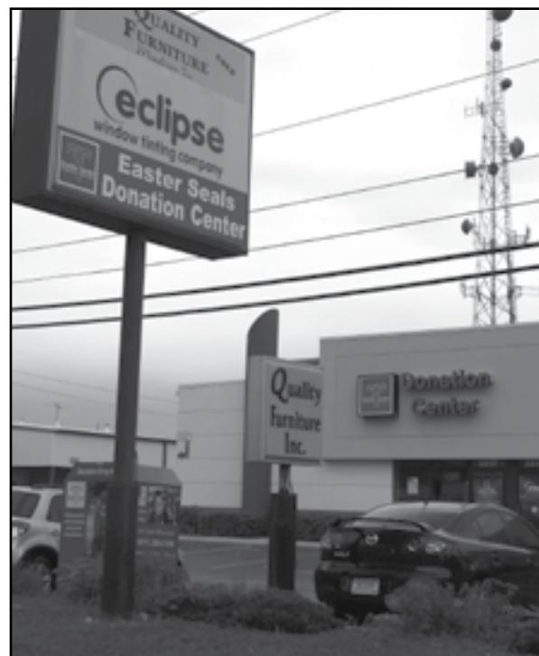
The Donation Center's new state office is located at 2217 S. Stoughton Road in Madison, across from Farm & Fleet.

To learn more, contact the Donation Center at 1.877.208.5109 or visit our website at www.EasterSealsWisconsin.com .